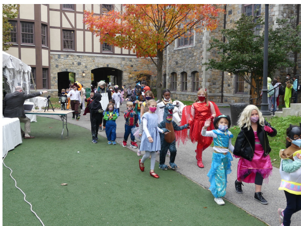
4th graders and their kindergarten buddies! By Waits May

From kindergarten to fourth grade, a student's Hackley life changes. Kindergarteners have a little bit of autonomy in school, but by fourth grade you are expected to learn leadership and responsibility. Examples of 4th grade leadership include sharing the morning announcements, kindergarten buddies, and leading the Snack and Shares. Also, they have to develop skills necessary for Middle School! As you go through the grades, not only does school change, so do you. It's a bit like shedding your skin. You slowly start to actually feel truly used to it, and all of a sudden, it drops off and you change. There is a fast change from follower to