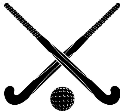
Field Hockey Sticks