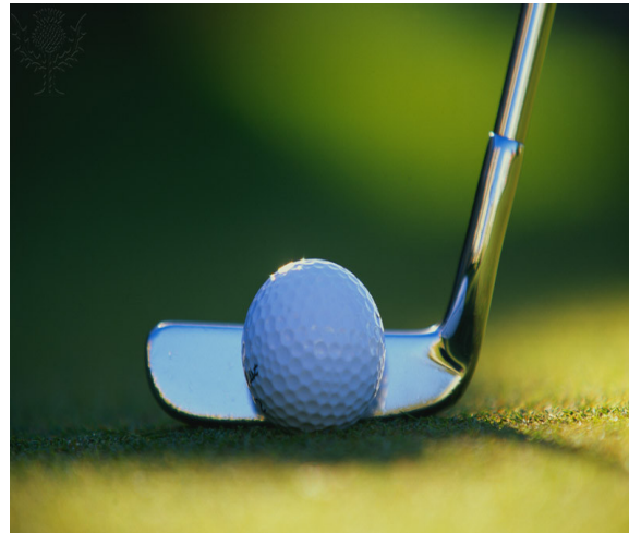
Golf ball & Golf club Britannica image quest

people who don't have a golf cart. Sometimes, you can even hitch a ride on someone else's golf cart! Finally, people don't usually get that mad even if they lose. Now I hope you know a little more about golf. See you in the next article.