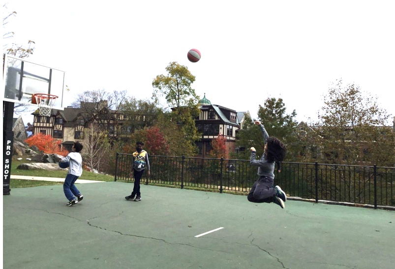
Taking the Shot

Do you feel like you are a talented writer or artist and want to share your skill? Well, you can now! For more details, visit THIS LINK .